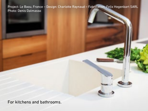
For kitchens and bathrooms.